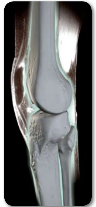
3-D modeling from MRI captures true patient anatomy.

Zimmer ® Patient Specific Instruments streamline total knee replacement surgery by ensuring accurate and reproducible guide fixation. Our proprietary stabilizing features enhance guide fixation while ensuring the end surgical result matches your preoperative plan. Based on the patient's MRI, mechanical axis-based pin guides conform precisely to the patient's anatomy. Zimmer Patient Specific Instruments simplify the total knee process from start to finish without compromising your surgical decision making, surgical technique, or intraoperative flexibility. Zimmer Patient Specific Instruments can give you the fit you can feel.